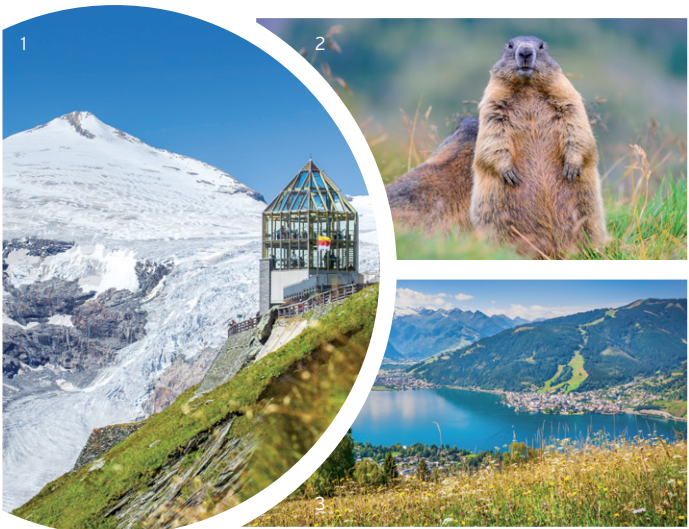
1) Franz Josefs Höhe, Großglockner 2) Marmots in the Alps 3) Zell am See

This is a scenic trip into the Hohe Tauern Nationalpark, on the High Alpine Road, which leads to the glacial base of Austria’s highest mountain, the Grossglockner (3798m). Be amazed by the spectacular scenery of the area and the incredible engineering feat of the Grossglockner road. The Grossglockner High Alpine Road has been an incomparable experience for about fifty million visitors since 1935.