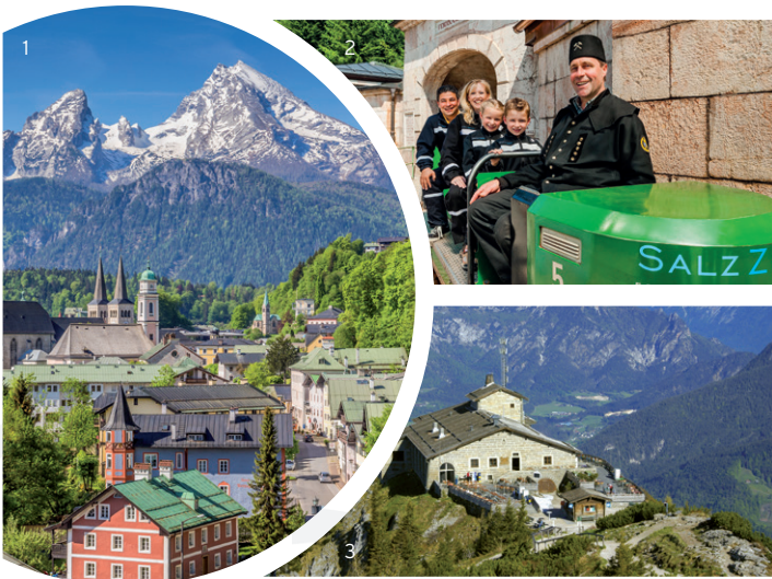
1) Berchtesgaden 2) Bad Reichenhall, Alte Saline 3) Kehlsteinhaus

Visit the Royal Bavarian Spa town, famous for its old working salt mines (optional € 17,- adult, € 9,50 child from 4 – 16 years) and Hitler’s Eagles Nest (optional € 16,60 adult, € 9,60 child up to 14 years). Salt mining has a long tradition in Berchtesgaden. The wealth of the whole region has its origin in the white gold. You will be given a guided tour of the complex tunnel system, which makes up part of the 500 year old mine, and will discover the origins of the famous Bad Reichenhall salt.